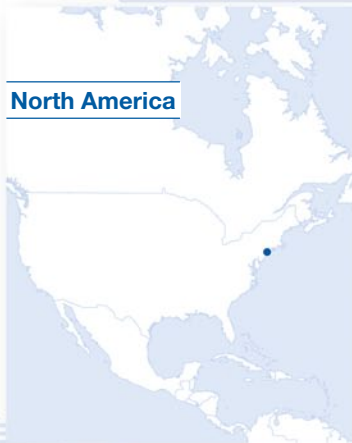
Structured Property Financing