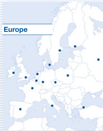
Structured Property Financing